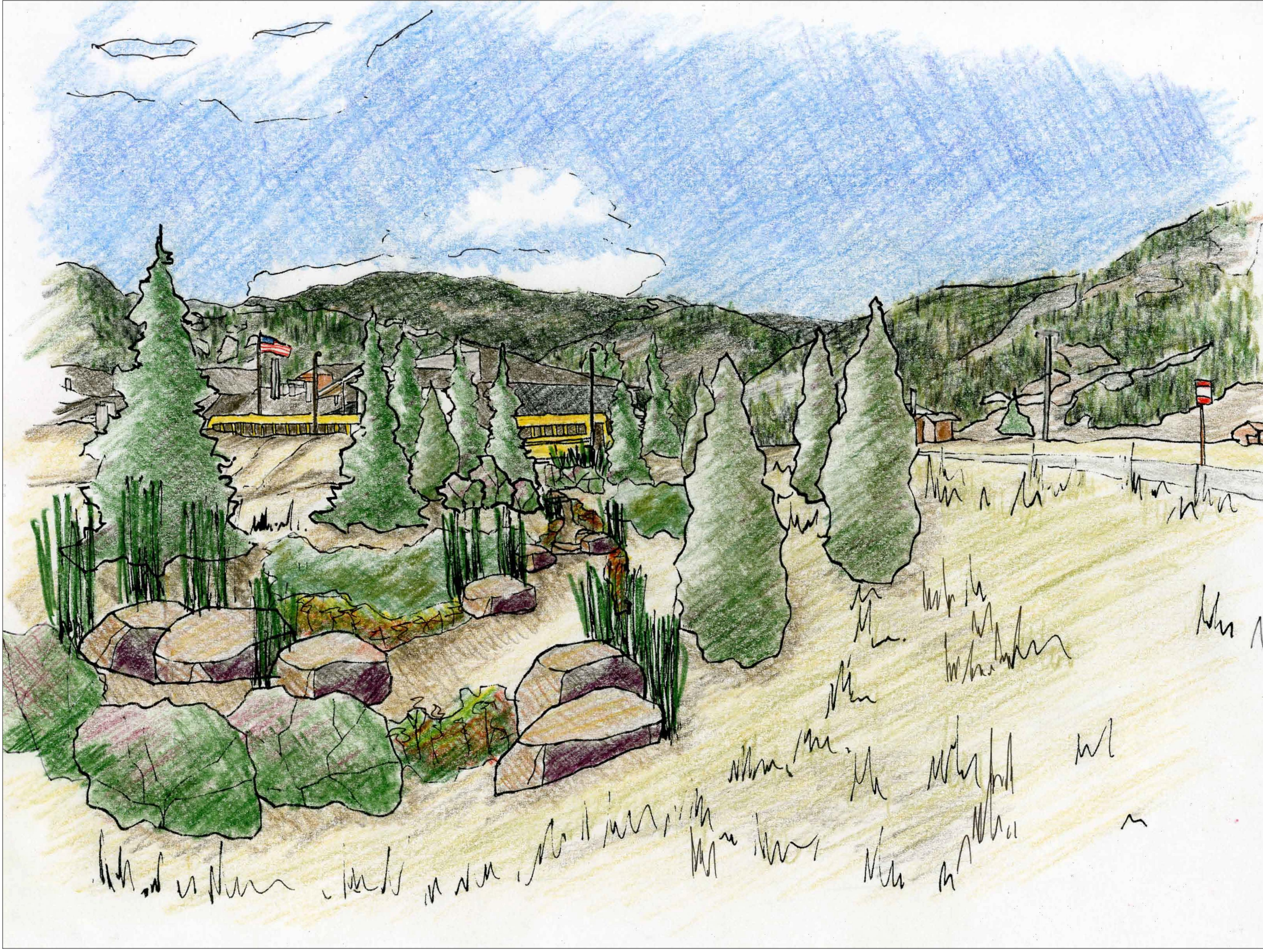
VIEW TOWARD SCHOOL